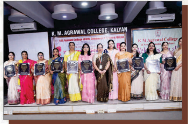
Felicitation of Newly elected Women Corporators of KDMC on Womens Day