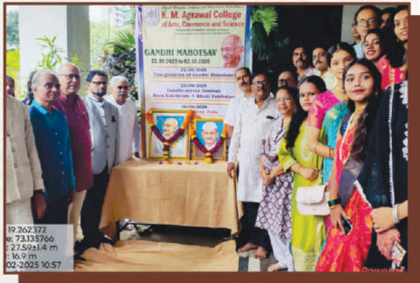
Celebrating Mahatma Gandhi & Lalbahadur Shashtri Jayanti