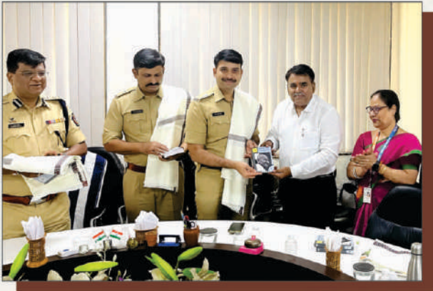
Welcoming Addl. CP Kalyan DCP-Uihasnagar and DCP-Kalyan at College