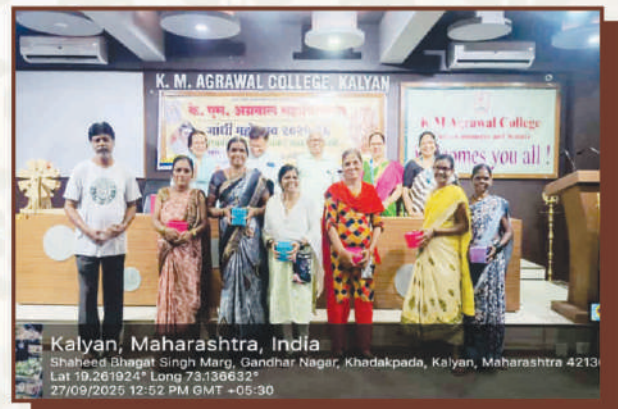
Felicitating Housekeeping Staff of the College in Gandhi Mohatsav