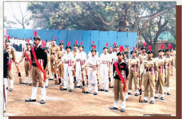
Independence Day Parade