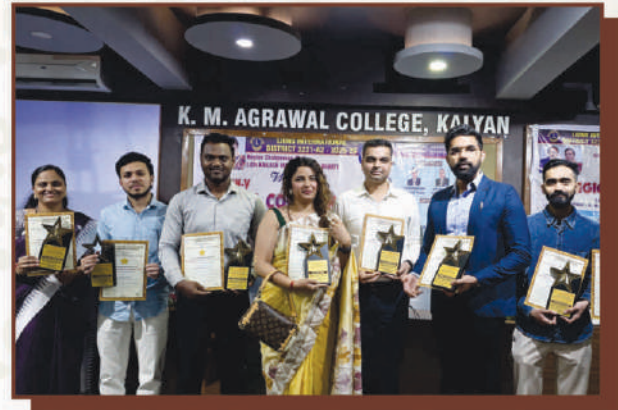
Awarding Agraj Purskar to Alumni of the College