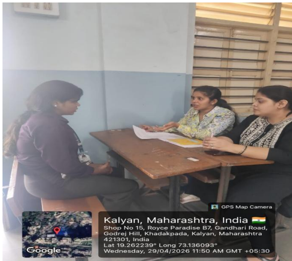
Kalyan, Maharashtra, India Shop No 15, Royce Paradise B7, Gandhari Road, Godrej Hill, Khadakpada, Kalyan, Maharashtra 421301, India Lat 19.262239° Long 73.136093° Wednesday, 29/04/2026 11:50 AM GMT +05:30