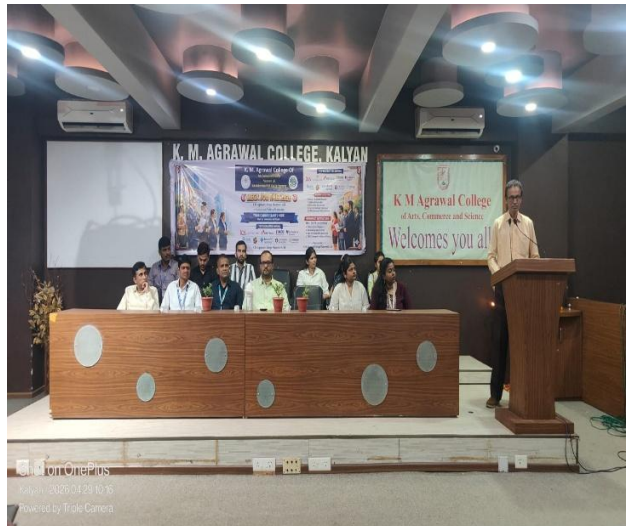
Kalyan, 29/04/2026 10:16 AM GMT +05:30