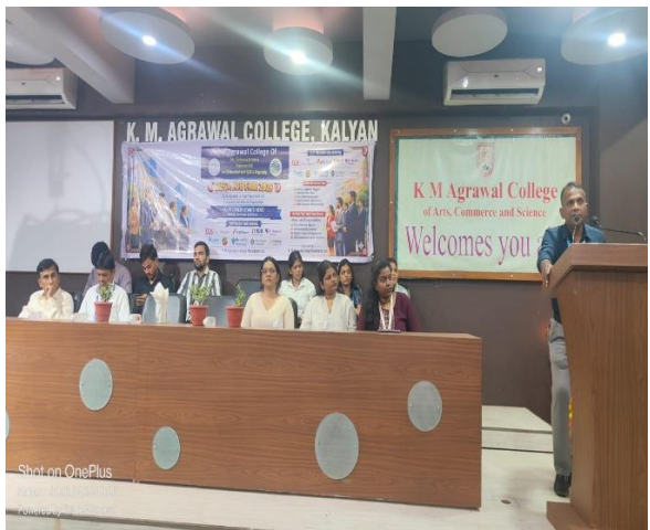
Kalyan, 29/04/2026 10:16 AM GMT +05:30