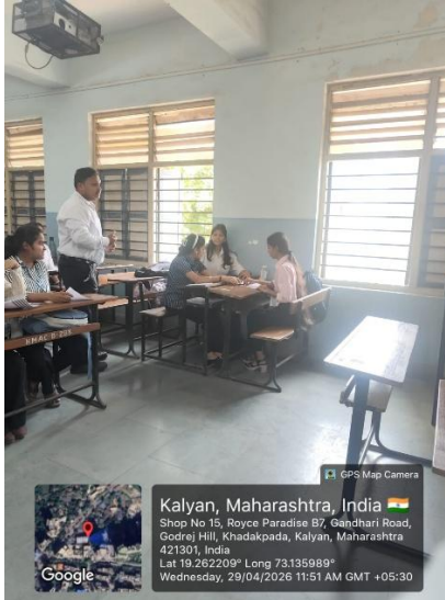
Kalyan, Maharashtra, India Shop No 15, Royce Paradise B7, Gandhari Road, Godrej Hill, Khadakpada, Kalyan, Maharashtra 421301, India Lat 19.262209° Long 73.135989° Wednesday, 29/04/2026 11:51 AM GMT +05:30