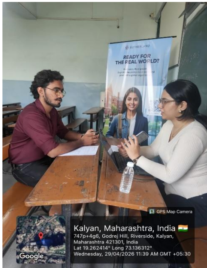
Kalyan, Maharashtra, India 747p+4g6, Godrej Hill, Riverside, Kalyan, Maharashtra 421301, India Lat 19.262414° Long 73.136312° Wednesday, 29/04/2026 11:39 AM GMT +05:30