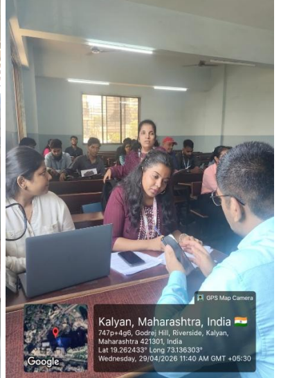
Kalyan, Maharashtra, India 747p+4g6, Godrej Hill, Riverside, Kalyan, Maharashtra 421301, India Lat 19.262433° Long 73.136303° Wednesday, 29/04/2026 11:40 AM GMT +05:30