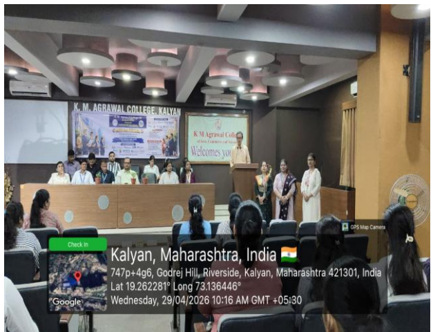
Kalyan, Maharashtra, India 747p+4g6, Godrej Hill, Riverside, Kalyan, Maharashtra 421301, India Lat 19.262281° Long 73.136446° Wednesday, 29/04/2026 10:16 AM GMT +05:30